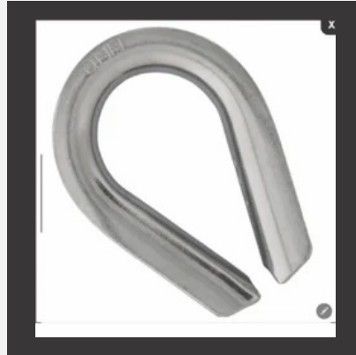
Wire Rope Thimbles