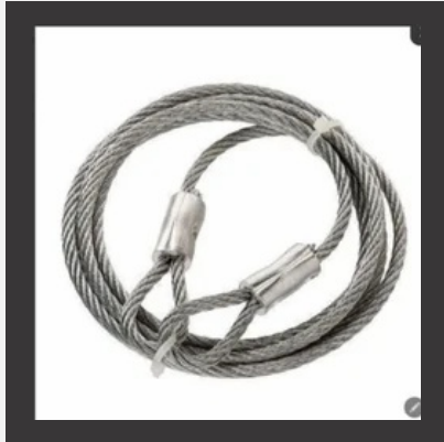
Steel Wire Rope Sling