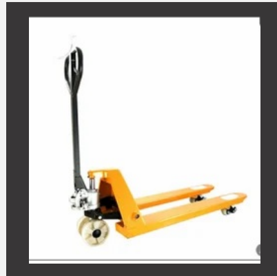
Hydraulic Hand Pallet Truck