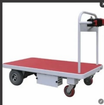
MS Electric Trolley