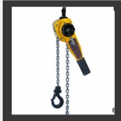
Ratchet Lever Hoist