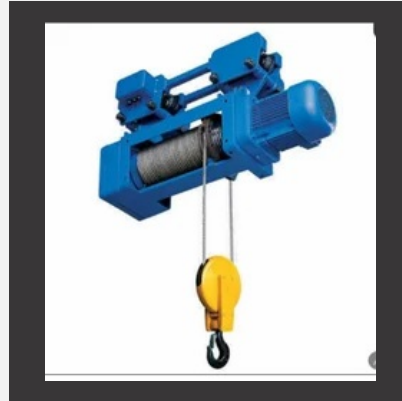
Electric Wire Rope Hoist