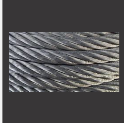
Mild Steel Wire Ropes Slings