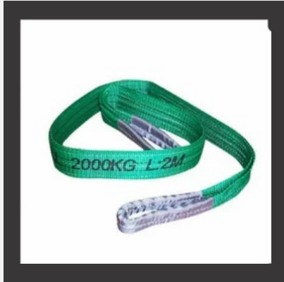
Flat Webbing Lifting Sling