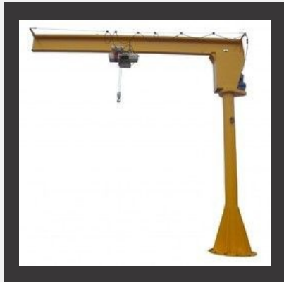
Jib Crane Machine