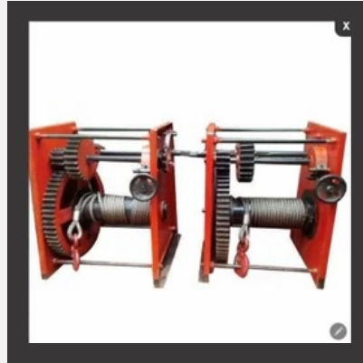
Manual Crab Winches