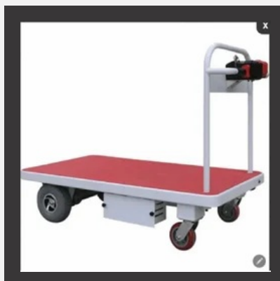
MS Electric Trolley