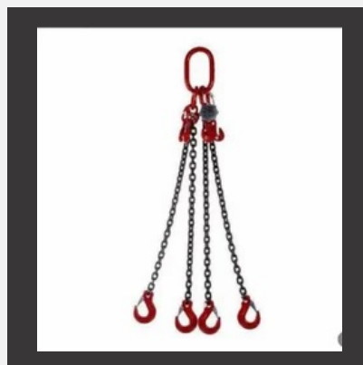
MS Chain Sling