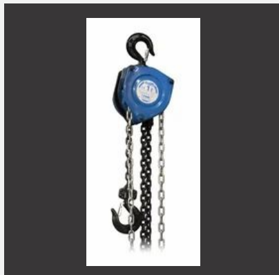
Indef Chain Pulley Block