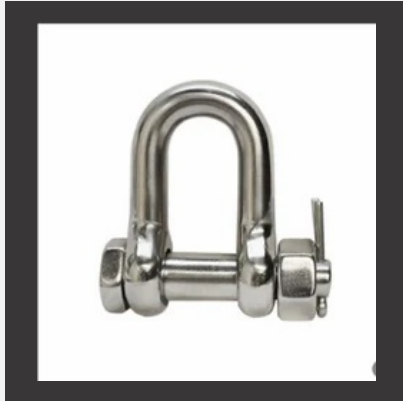
Stainless Steel D Shackles