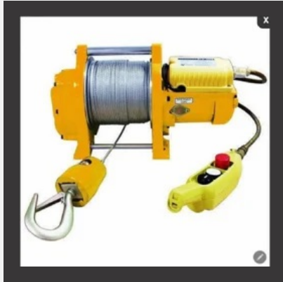
Electric Rope Winch