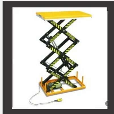
Scissor Lift Machine