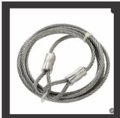
Steel Wire Rope Sling