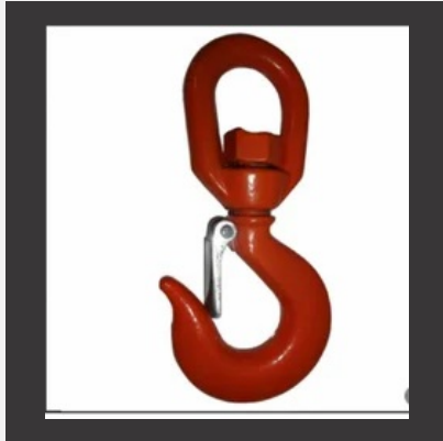
Lifting Shank Hook