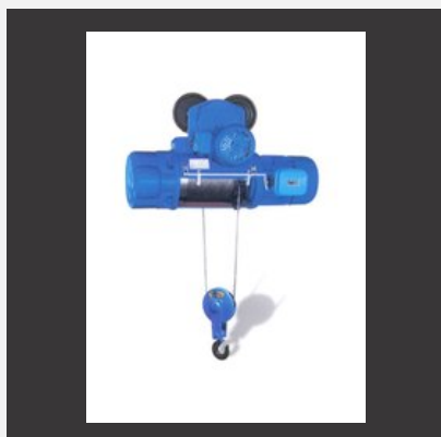
Wire Rope Hoist