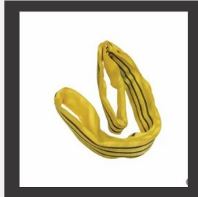
Round Webbing Sling