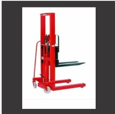
MS Hydraulic Stacker