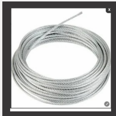
Galvanized Wire Rope