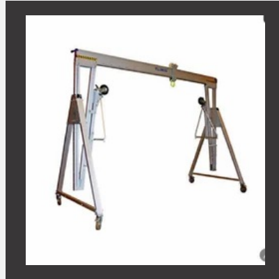
Single Girder Gantry Crane