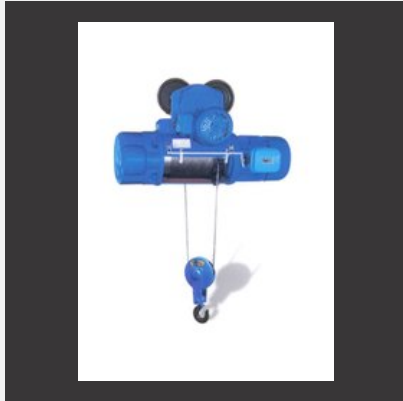
Wire Rope Hoist