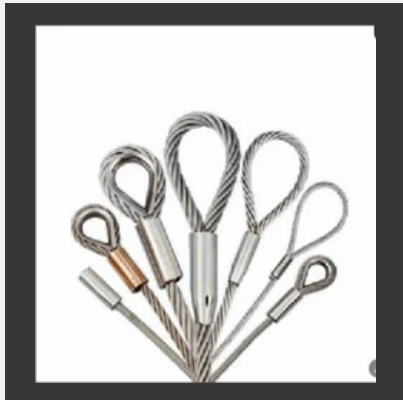
Wire Rope Slings