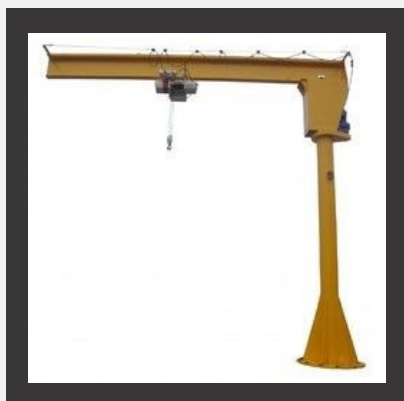
Jib Crane Machine