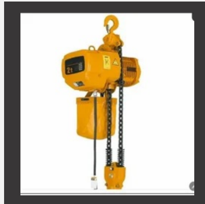
Electric Chain Hoist