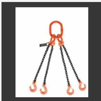
Alloy Steel Chain Sling