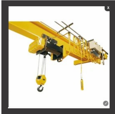
Industrial HOT Cranes