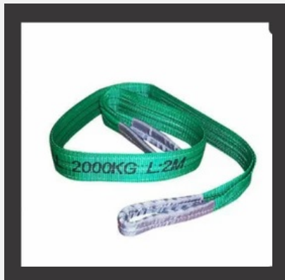
Flat Webbing Lifting Sling