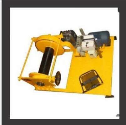
Electric Winch Machine