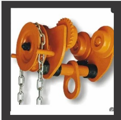
MS Geared Trolley