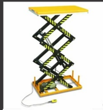
Scissor Lift Machine