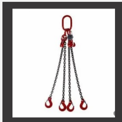
MS Chain Sling