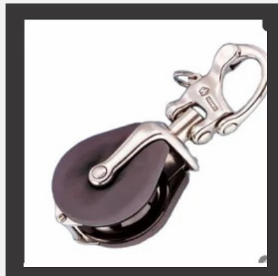
Snatch Block Pulley