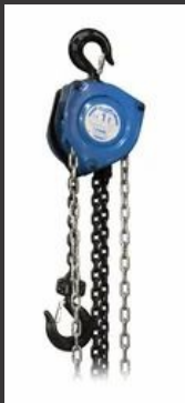
Indef Chain Pulley Block