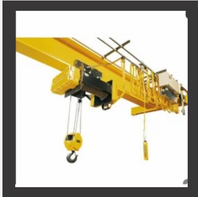
Electric EOT Crane