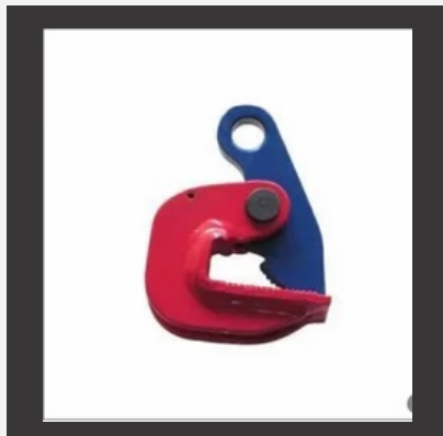
Plate Lifting Clamp