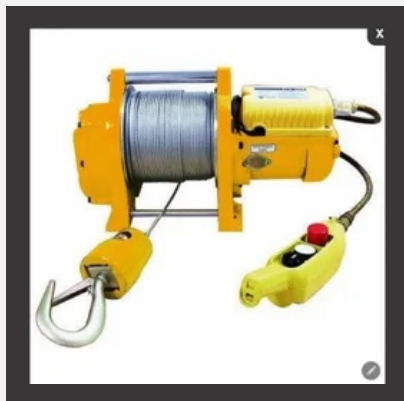
Electric Rope Winch