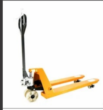
Hydraulic Hand Pallet Truck