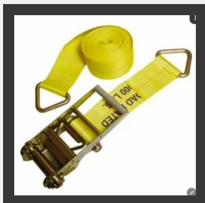
Ratchet Lashing Belt