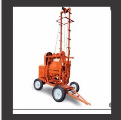
Builder Hoist Machine