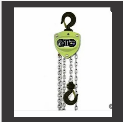
Chain Hoist Machine