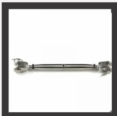
Rigging Screw Machine