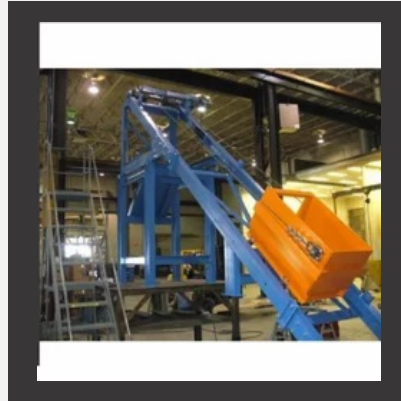
Skip Hoist Machine