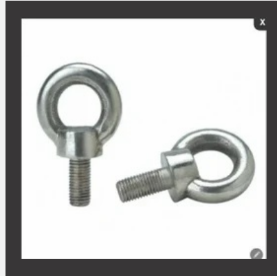
Stainless Steel Eye Bolts