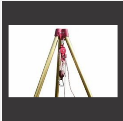
Lifting Tripod Stand