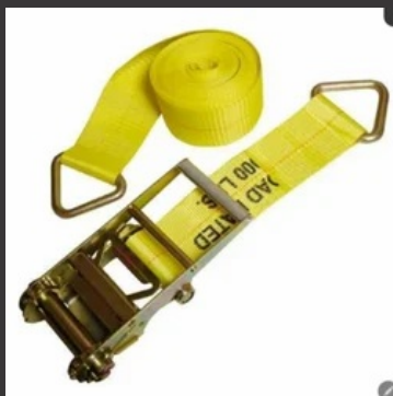
Ratchet Lashing Belt