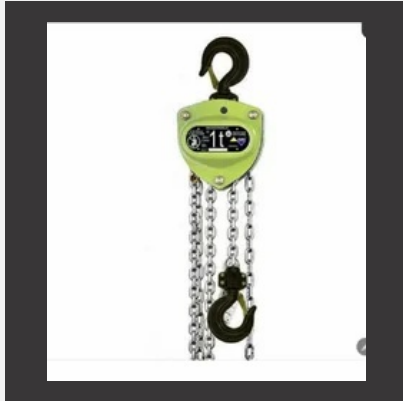
Chain Hoist Machine