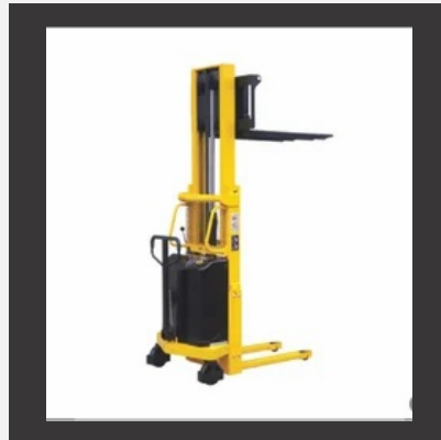
Electric Stacker Machine