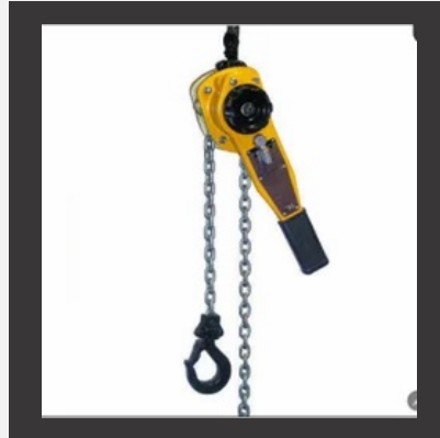
Ratchet Lever Hoist