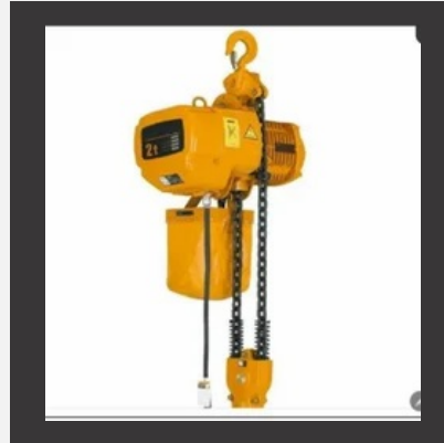
Electric Chain Hoist