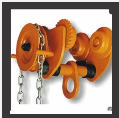
MS Geared Trolley