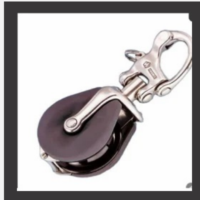
Snatch Block Pulley