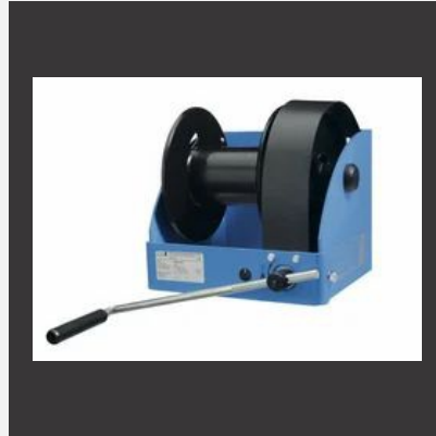
Portable Power Winch