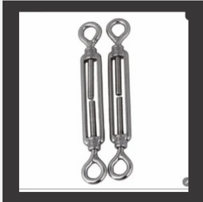
Stainless Steel Turn Buckles