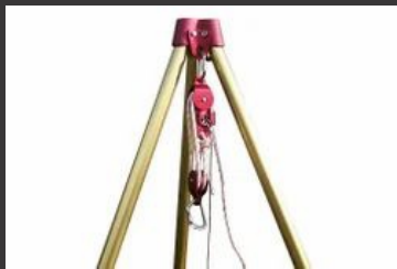
Lifting Tripod Stand