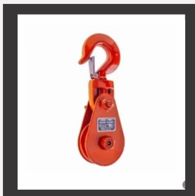
Wire Rope Pulley Block