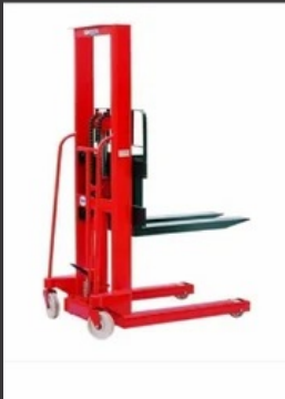
MS Hydraulic Stacker