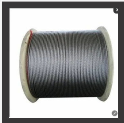
Stainless Steel Wire Ropes