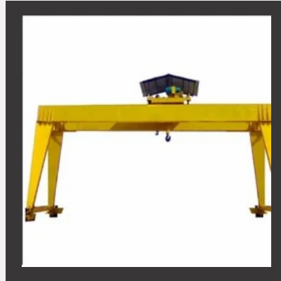
Goliath Crane Machine